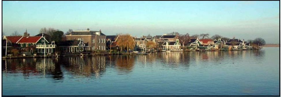
Houses overlooking the lakes in Holland

Your support for cancer research on the campus of Freed-Hardeman University will directly fund significant research in the war on cancer. Furthermore, you will provide an opportunity for our science students to conduct significant cancer research which will give them laboratory experience for their scientific and medical careers.